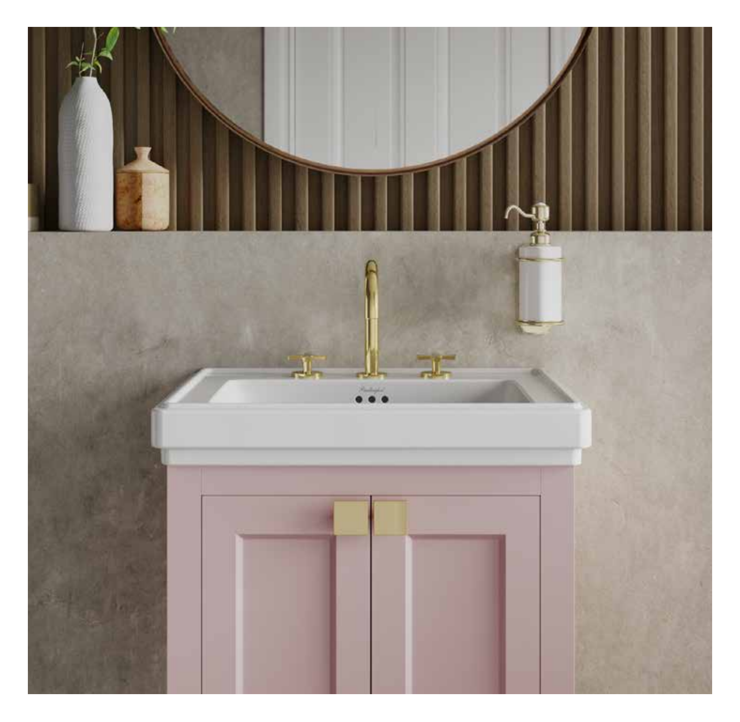
Riviera 580mm Square basin with 580mm Matt Pink vanity unit with Gold handles, 3 tap hole basin mixer and click-clack waste. Single soap dispenser. Riviera close-coupled open-back WC with Gold cistern lever and soft-close seat. Windsor bath with claw feet, White and Riviera 3 hole bath filler and bath overflow, plug and chain. All fittings and accessories are Gold finish.

The Mediterranean's balmy climate positively encourages taking your time over things. Riviera furniture is available in a range of soft shades that give your bathroom that same pleasant sense of unhurried indulgence.