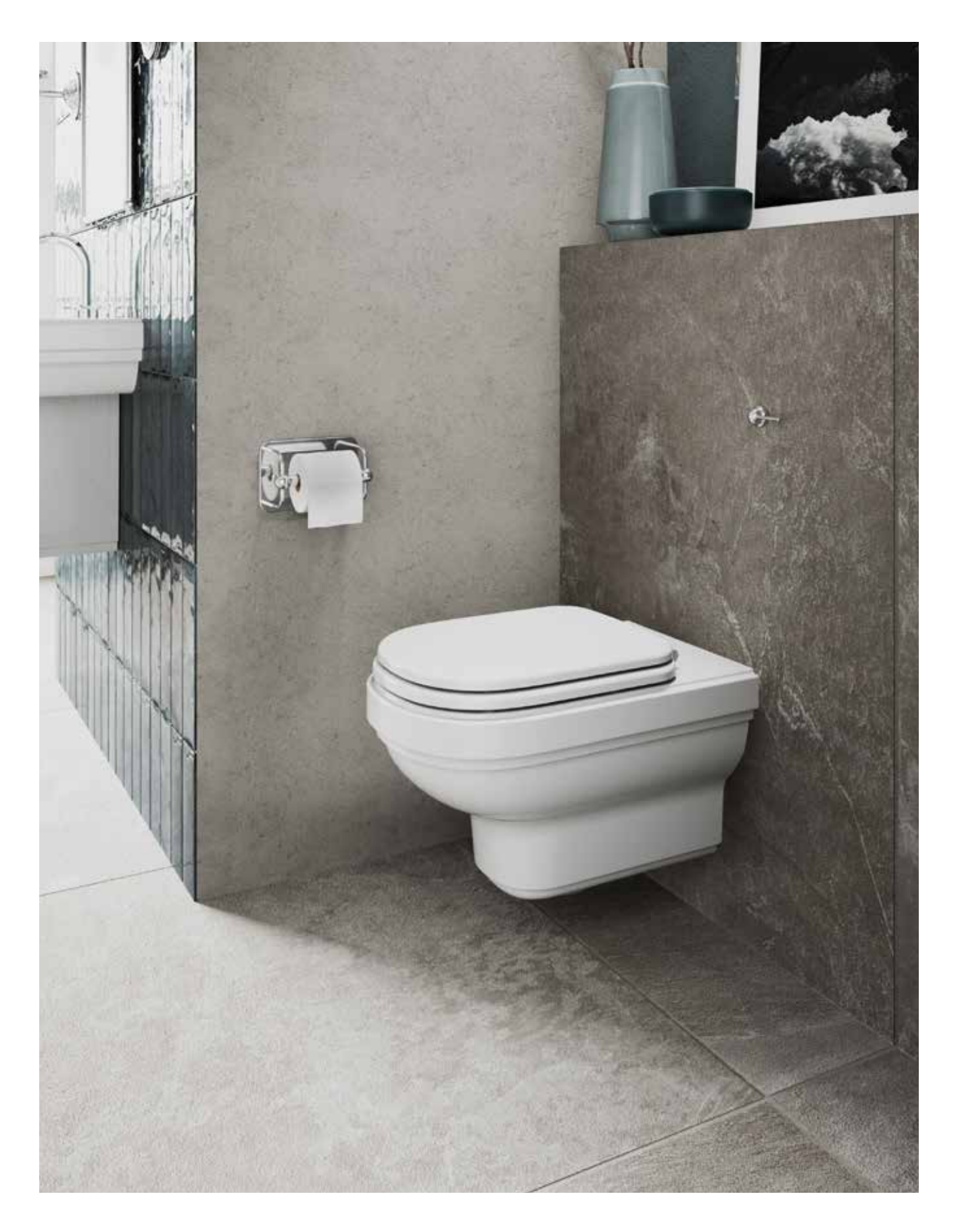
Left: Riviera 580mm D shape basin with semi pedestal, 3 tap hole basin mixer, click-clack waste. Burlington Arched mirror, round lights and towel ring. Right: Riviera wall hung WC with soft-close seat, concealed cistern including lever and WC roll holder. All fittings and accessories are Chrome.