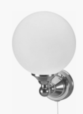
Edwardian Single Round LED Light chrome