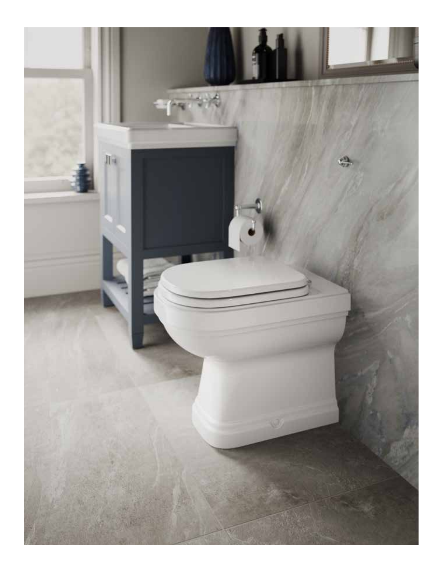
Riviera 650mm Square basin with 650mm Matt Blue vanity unit, wall mounted basin mixer and click-clack waste. Riviera back-to-wall WC with soft-close seat, concealed cistern including lever. Soap dish and WC Roll holder. All fittings and accessories are Chrome.