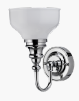
Burlington Ornate light with chrome base and opal glass cup shade