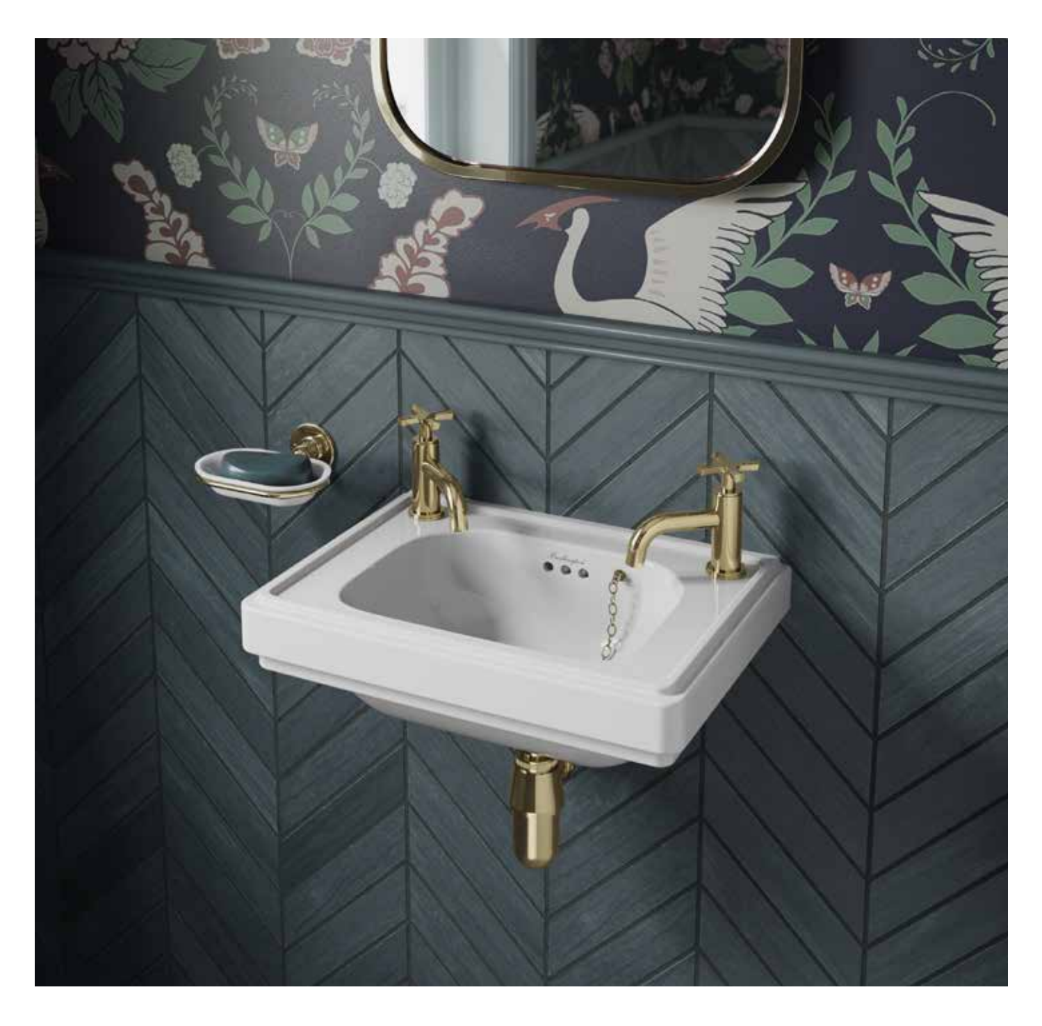
Riviera 450mm 2 tap hole cloakroom basin, Riviera pillar taps, plug and chain waste and bottle trap. Soap dish and Towel ring. Riviera back-to-wall WC with soft-close seat, concealed cistern including lever. WC roll holder. All fittings and accessories are Gold finish.

The cloakroom may not be the largest room in your home, but it's the one all your visitors are likely to see and make use of. The Riviera Collection's simple, uncluttered design and sensible range of sizes means it works beautifully at all scales, so even the smallest space can still be perfectly formed.