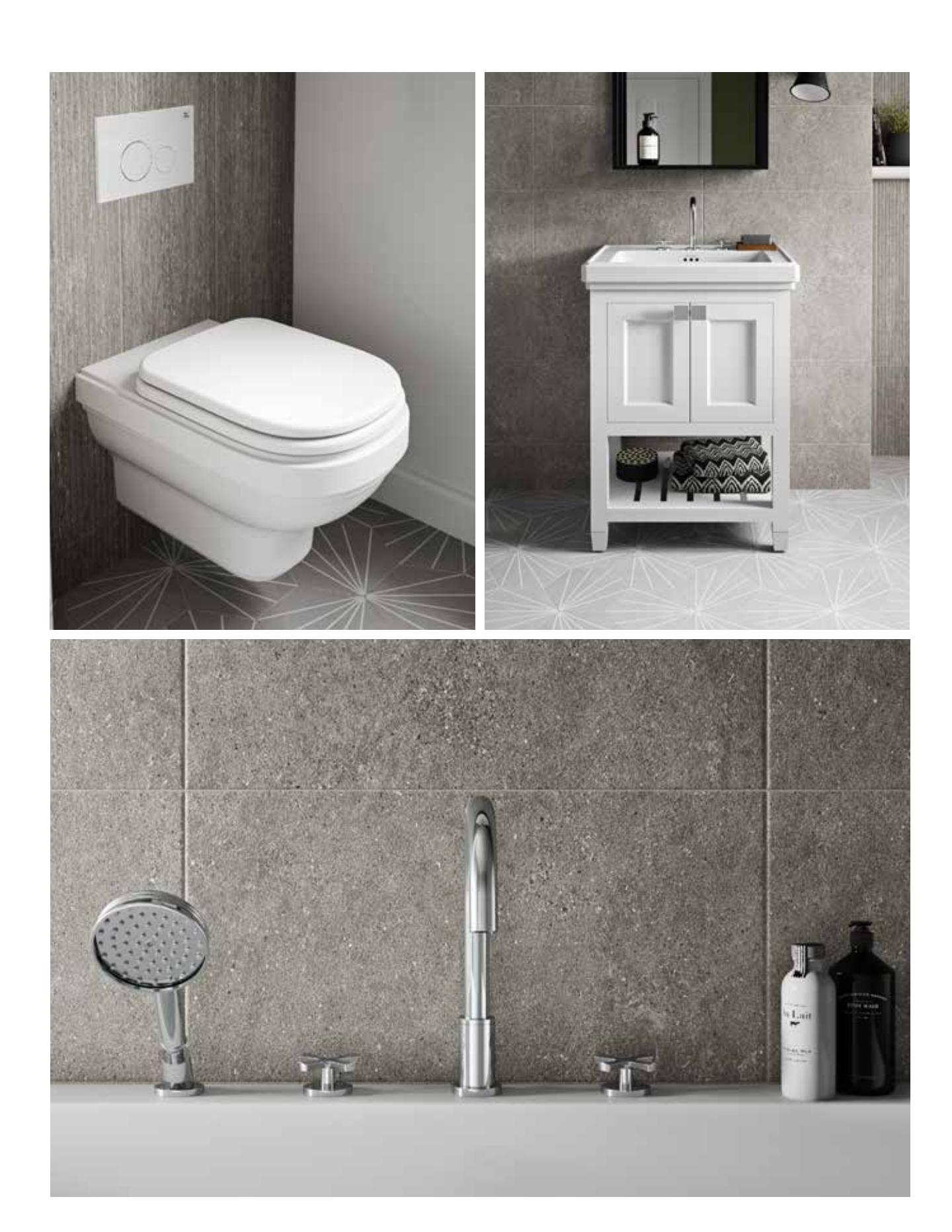
Left: Riviera 650mm Square basin with 650mm Matt White vanity unit, 3 tap hole basin mixer and click-clack waste. Above: Riviera wall hung WC with soft-close seat and Crosswater in wall frame and glass flush plate. Clearwater Patinato Petite bath, smart waste, shown with Riviera 4 hole bath mixer including handset and pull out hose. All fittings and accessories are Chrome.